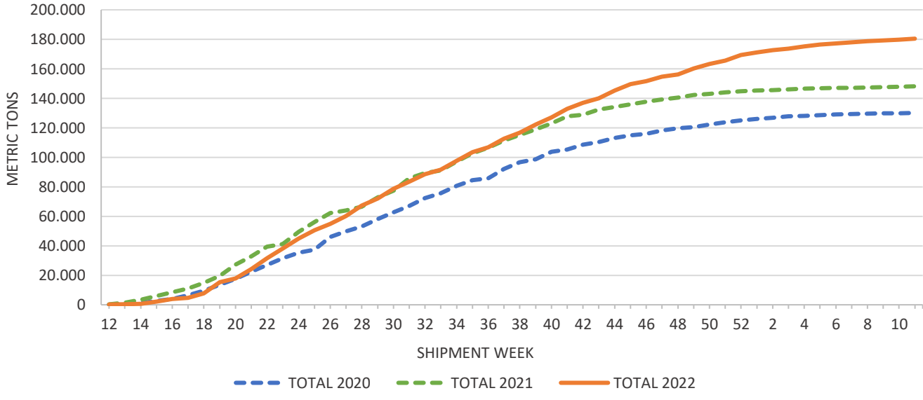
WALNUT SHIPMENTS ACCUMULATED - TOTAL EQ. INSHELL (METRIC TONS)

--- TOTAL 2020 --- TOTAL 2021 --- TOTAL 2022